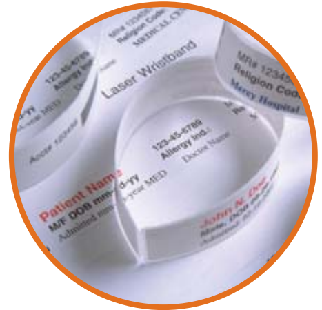
Issue patient wristbands that include demographic data pulled directly from the HIS.