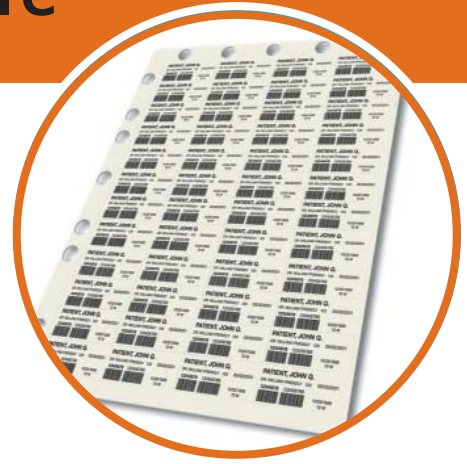
Print chart and flag labels with built-in templates.

Dealing with paperwork is a constant challenge for acute and ambulatory healthcare organizations. Dataworks 3 for Healthcare from RICOH® helps providers bring speed and accuracy to two of the most common examples: labels and forms. This software pulls patient information directly from the health information system (HIS) and prints pre-populated labels and forms whenever and wherever you need them.