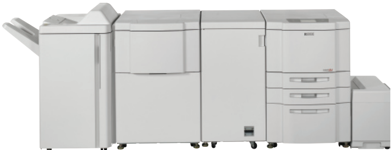
Ricoh DDP184 - 184 image per minute digital printer with highlight color and MICR capability

We are investing in the production printing marketplace – and the results will benefit you. Please peruse the information in this newsletter and on your personalized online Production Printing Resource Center. Most importantly, however, please share your specific business, application and production needs with your Production Print Specialist so that Ricoh can develop a uniquely tailored approach to help you resolve them.